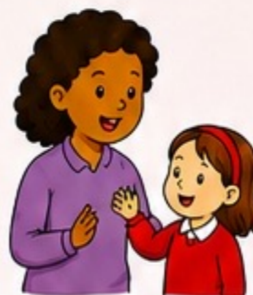
Involve families as partners in progress