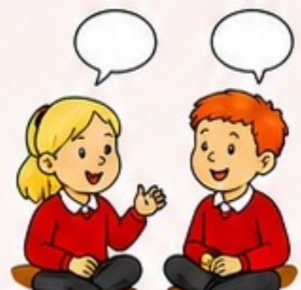
Provide targeted support for those who need it