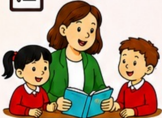
Make communication a daily priority